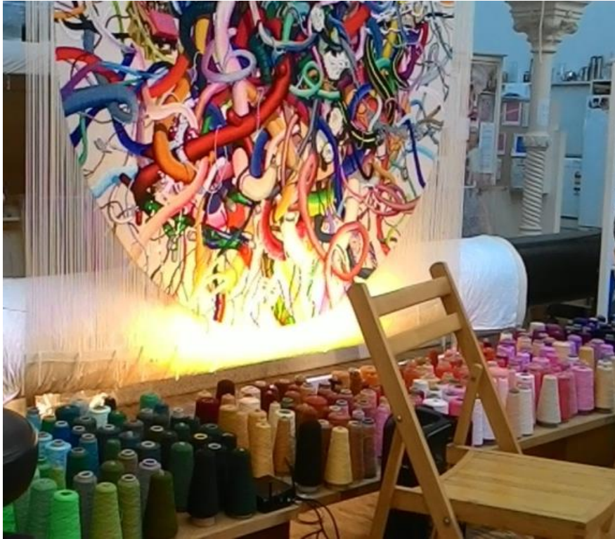
Gordian Knot Tapestry