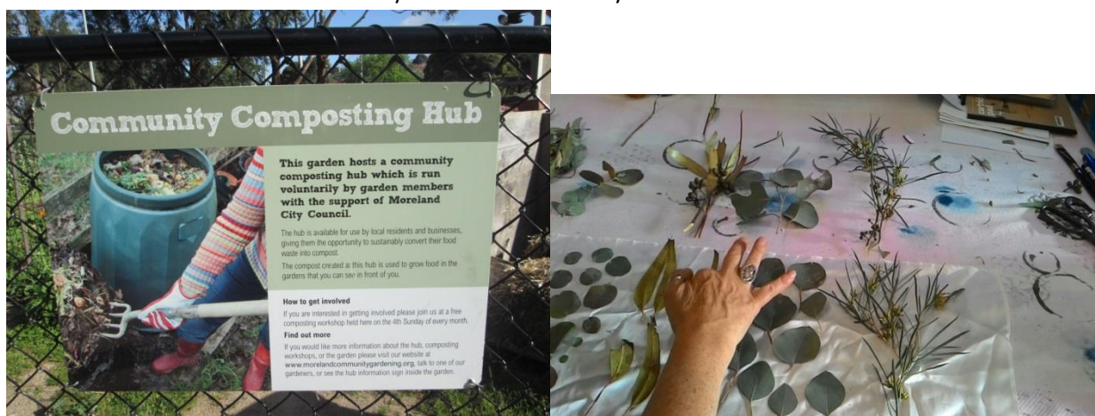
Environment conscious society