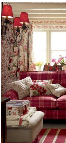
Laura Ashley prints.

Visited Fashion apparel and Home Fashion retail outlets in Melbourne City ( ZARA, Laura Ashley , Supre, Forever new, Target, etc. )to view the latest design trends in home fashion Industry and apparel.