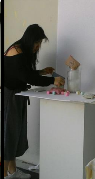
Flat Lay photo shoot