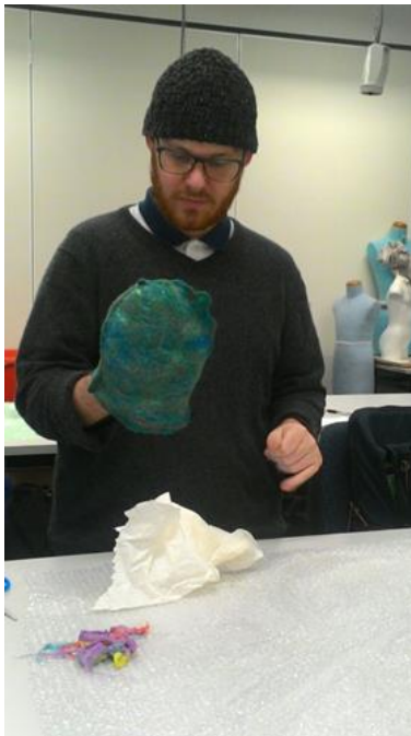
Students exploring design ideas with felt.

Natural Dye workshop by Ms. Su : Demonstration and discussion on the subject encouraging natural and organic aspects of global demand , along with visit to the dyeing labs, swatch explorations ,Indian practices for natural dyes was impressive and knowledge enhancing. Some sustainable natural dye practices in India were discussed with students.