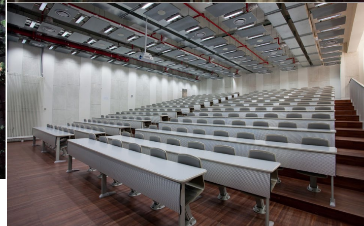
Ewha Womans University Ewha Campus Complex, Medium Auditorium.....