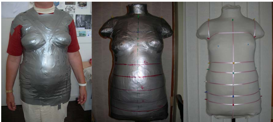
Figure 3 - Building clone 2. From left: capturing actual body shape, mounting on stand, completed clone.

Certain girths are not traditional, for example the 'waist' is not the preferred waistband position, but where the mid torso is narrowest; whilst a critical marker is the most protruding point of the stomach. To use this information to inform the fit of the front panel of a garment it is necessary to know it's vertical position between bust and widest lower frontal width (hip), distance horizontally in space relative to these parts of the body (X-Y position) and the girth's distribution around the body. These