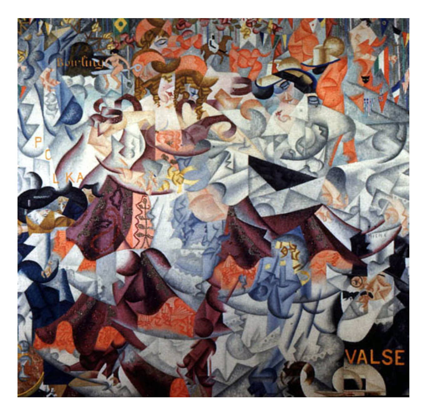
Figure 1. Gino Severini, Dynamic Hieroglyphic of the Bal Tabarin (1912), Oil on canvas, with sequins, 161.6 x 156.2 cm, The Museum of Modern Art, New York. Acquired through the Lillie P. Bliss Bequest.

By drawing on the world of costume and fashion design, Severini had defeated the immobile nature of the picture by literally reflecting light off the surface in these images of 'a dancer covered in sparkling sequins in her world of light, noise and sound' (Severini, 1973, p. 124). As Christine Poggi has argued, whereas the neo-impressionist painters, including Georges Seurat, had sought to intensify their canvases by effects of colour contrast and complementary colours, Severini had 'found a way of capturing real, flickering light from the surrounding ambience and