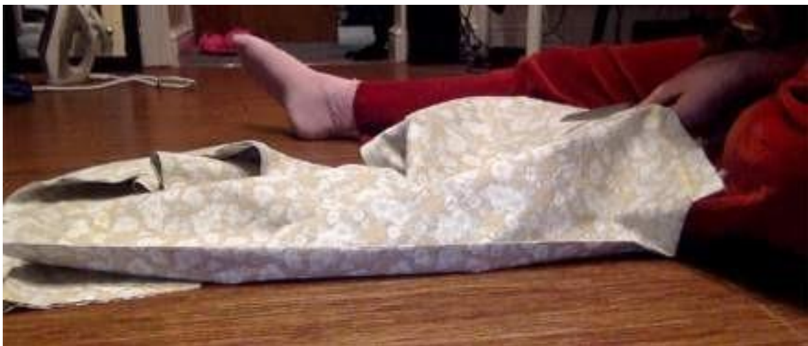
Figure 1. Example video still, participant cutting out fabric pieces for a skirt

Participants recorded their making activities through short video clips and written journals (Images 1&2). Journals and videos were used to inform the interviews that followed each iteration of making activity.