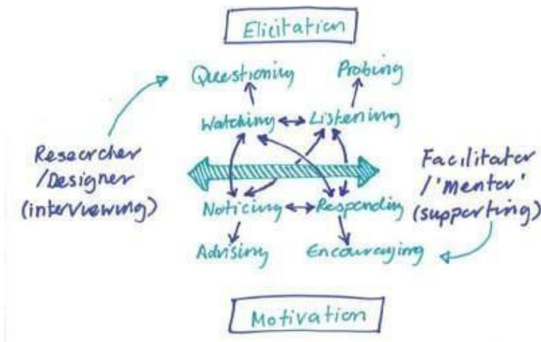
Figure 3. Rough sketch: complex roles of researcher/facilitator in the online elicitation process

While I did not always feel I got the balance of these two roles quite 'right', I would align the approach taken with an 'ethics of care' that is flexible to individual circumstances (Kara 2018, p35) and appropriate to the reciprocal nature of participatory research (Twigger Holroyd & Shercliff 2020). Taking a dialogic approach to the elicitation process allowed conversations to develop and flow more naturally and helped mitigate some of the unfamiliar intensity of the one-to-one online interview format.